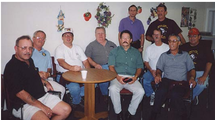
Golf Co. Marines at the Association Meeting