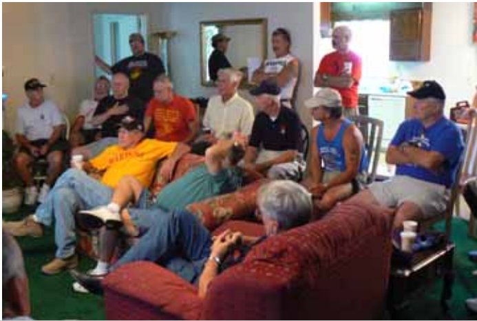
Golf 2/5ers at the Association Meeting