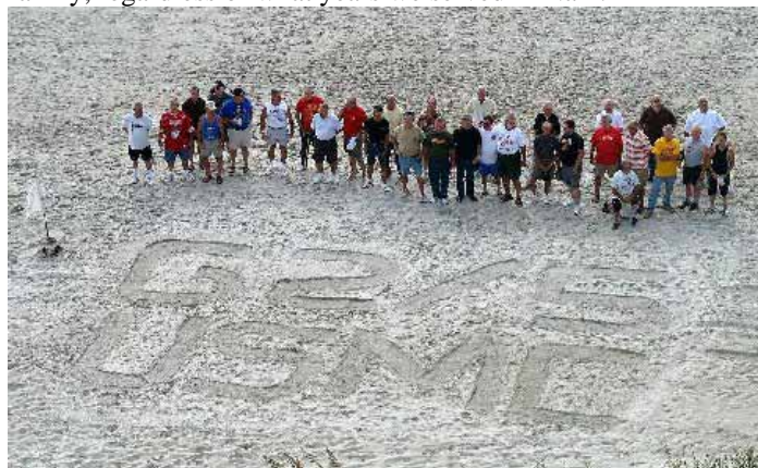
Some of the Golf 2/5 Vets who spelled out "Golf 2/5 USMC" in the Myrtle Beach sand