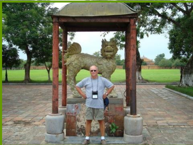
Citadel Then & Now - 45 years later...less a weapon and some hair!

12 Feb Thur (Day Thirteen) We finish our visit to Hanoi with a walking tour of the Ho Chi Minh Mausoleum and Presidential Palace plus a trip to the Hoa Lo Prison (“The Hanoi Hilton”). Remainder of the day for some last minute shopping and preparations for our evening flight home. Hotel: Silk Path (B/L)