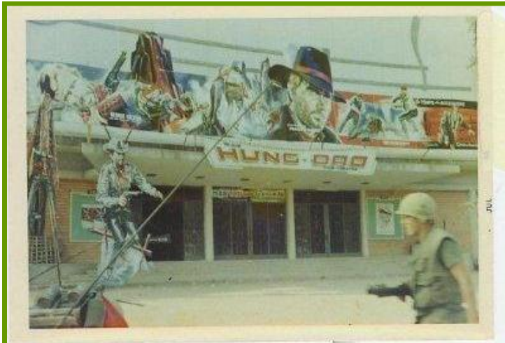
Hue - North side of River Rau Quist Heading West

5 Feb Thur - (Day Six) Our day begins with a drive north to Hue City, passing over the top of the Hai Van Pass, and down through Lang Co and the Phu Loc Region - one of the prettiest and most photogenic in all of Viet Nam. We'll have plenty of time to stop along the way for any special requests including the Troui River Bridge. Upon entering Hue, we proceed to our hotel and check in and have lunch at a local restaurant. This day is used to visit the Thien Mu Pagoda and an optional trip to the famous tombs in Ming Mang. The remainder of the day will be devoted to personal exploration of the city. Hotel: Huong Giang (B/L/D)