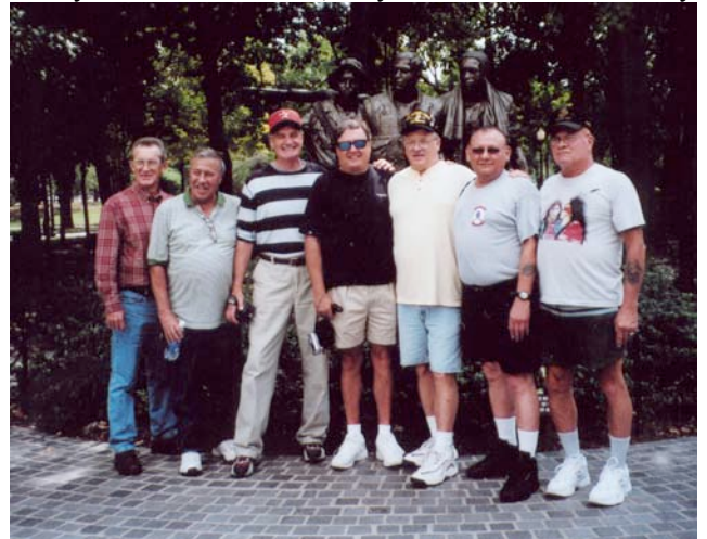
Some of our Chu Lai First-Timers: