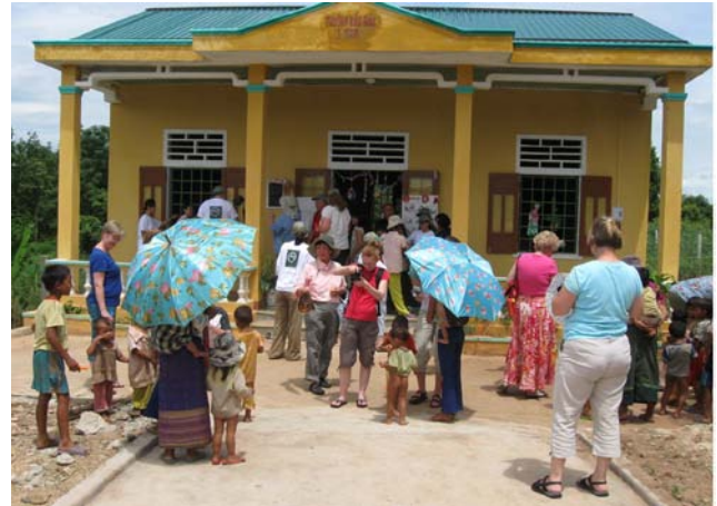
The Dedication of the Jesse Griego Kindergarten

Again, if any of you that did attend the reunion would like to send some photos and an article on the reunion, please email them to me so I can include in the next newsletter.